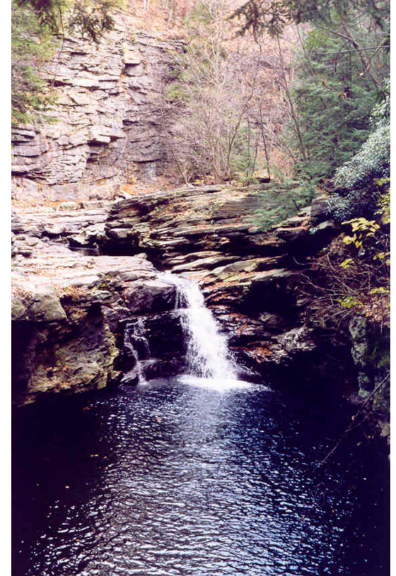
Nay Aug Gorge and Falls Area - Scranton

“The Lackawanna... takes its name from the Indian tongue and signifies the meeting of two streams... once abounding in fish of every variety, particularly known for its brook trout... gliding silently by over the gravelly bars dancing in the sunshine... a river of the purest spring water... along its banks, thick with hemlock, oak and pine were deer and moose... among groves of rhododendron and laurel.”