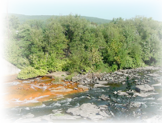
The Old Forge bore-hole is the largest AMD point source of pollution on the North

American continent and responsible for 60 million gallons of mine water per day, 7,000 pounds of iron oxide per day, and 25% of iron pollution into the Susquehanna River.