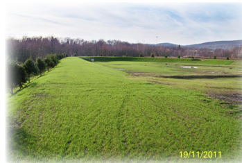
Reclamation of Misty Ridge in Old Forge

LRCA has partnered with Scranton Tomorrow, Lackawanna Heritage Valley Authority, PA American Water, businesses, civic organizations, & schools for environmental presentations, programs, and fairs.