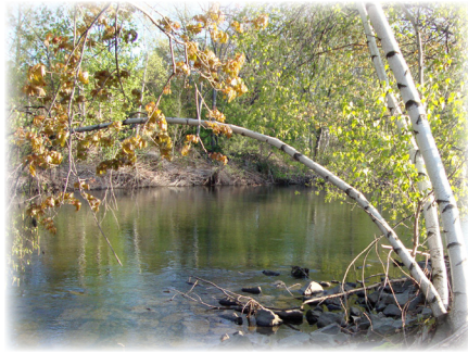
The Lackawanna River Conservation Association (LRCA) was founded in 1987.

The Mission of the LRCA is to involve the citizens of the Lackawanna River Watershed with the conservation and stewardship of the river, its tributary streams and water resources. Our mission is achieved through five goals ( Lackawanna River Citizen's Master Plan developed in 1990 and updated in 2003):