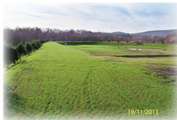
Reclamation of Misty Ridge in Old Forge

LRCA has partnered with Scranton Tomorrow, Lackawanna Heritage Valley Authority, PA American Water; businesses, civic organizations, schools for environmental presentations, programs, and fairs.