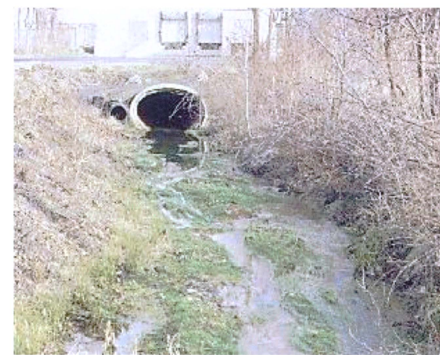
8. Lackawanna Outfall Blakely