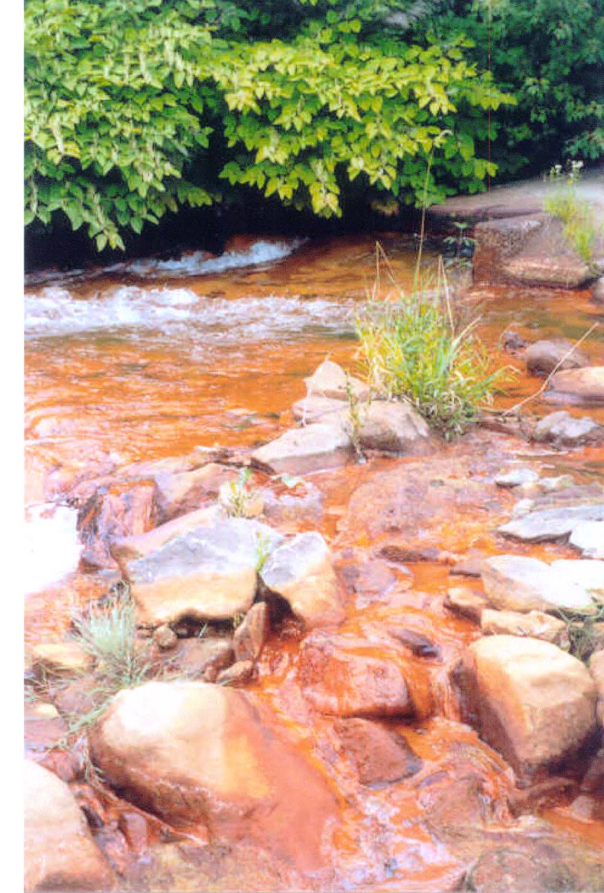
9. Old Forge Borehole Old Forge