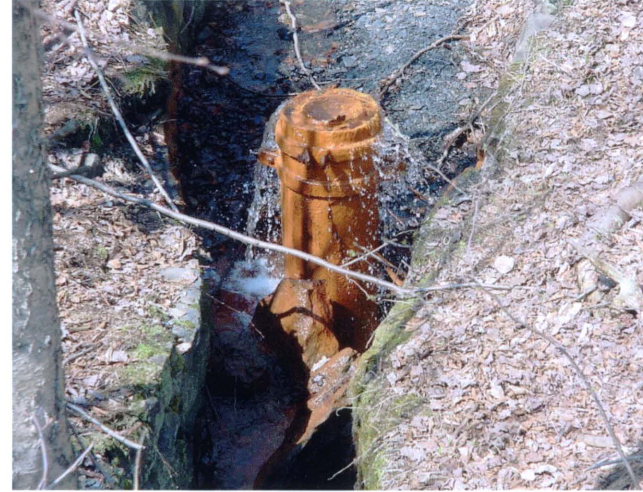
2. Standpipe Outfall Vanding