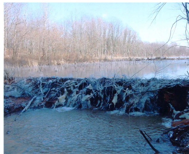
10. Duryea Outfall Duryea