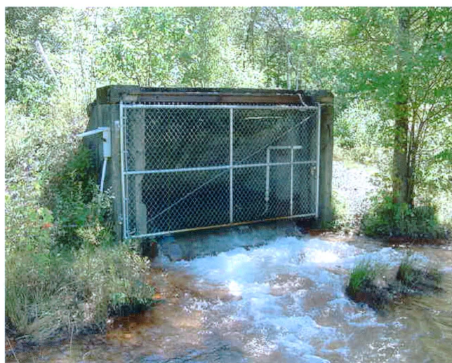
7. Gravity Slope Outfall Archbald