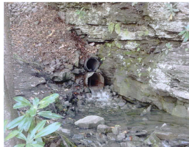
6. Waddell Outfall Archbald