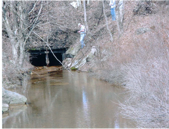
1. Vanding Outfall Vanding