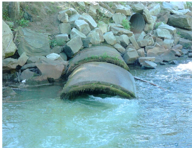
4. Jermyn Outfall Jermyn