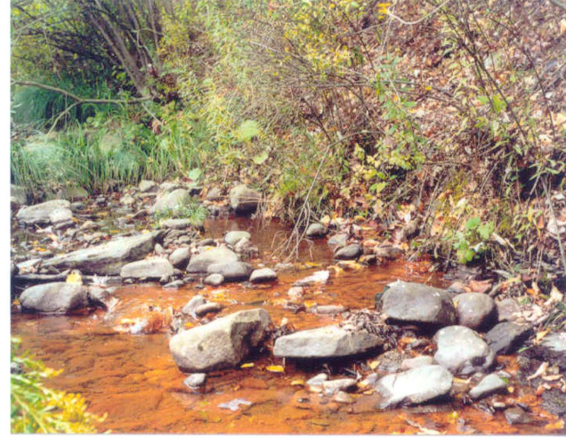
3. Upper Wilson Seeps Simpson