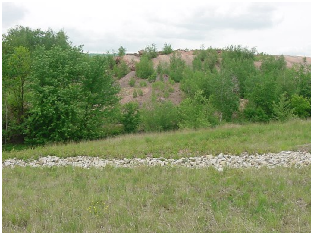
Mine reclamation completed by PA Bureau of Abandoned Mine Reclamation, on a bond forfeiture site in Taylor, PA