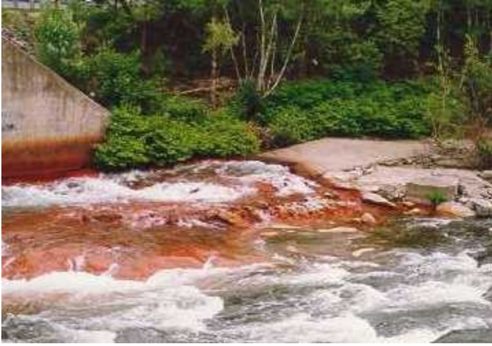
Outlet of the Old Forge Borehole adjacent to the Union St. Bridge, in Old Forge, PA. This borehole was constructed in 1962 by the Commonwealth of Pennsylvania. It discharges approximately 100 million gallons per day.