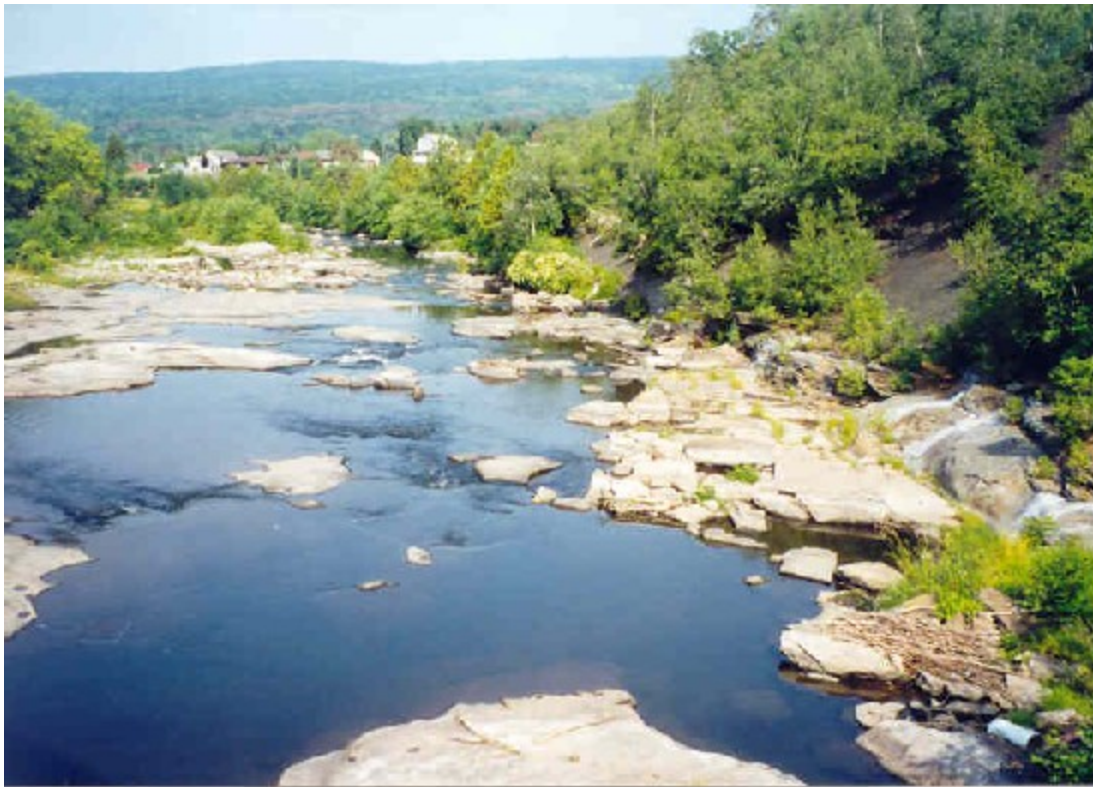
Lackawanna a River in Old Forge