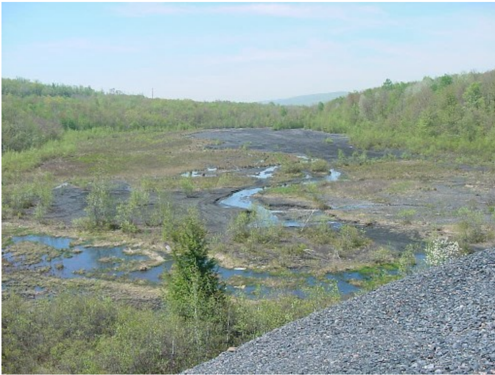
Upper Silt Basin on Powderly Creek in Carbondale Twp.