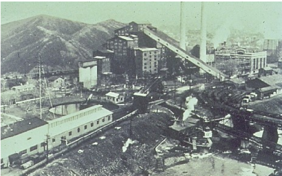
Aerial View of Olyphant Colliery (ca. 1920)