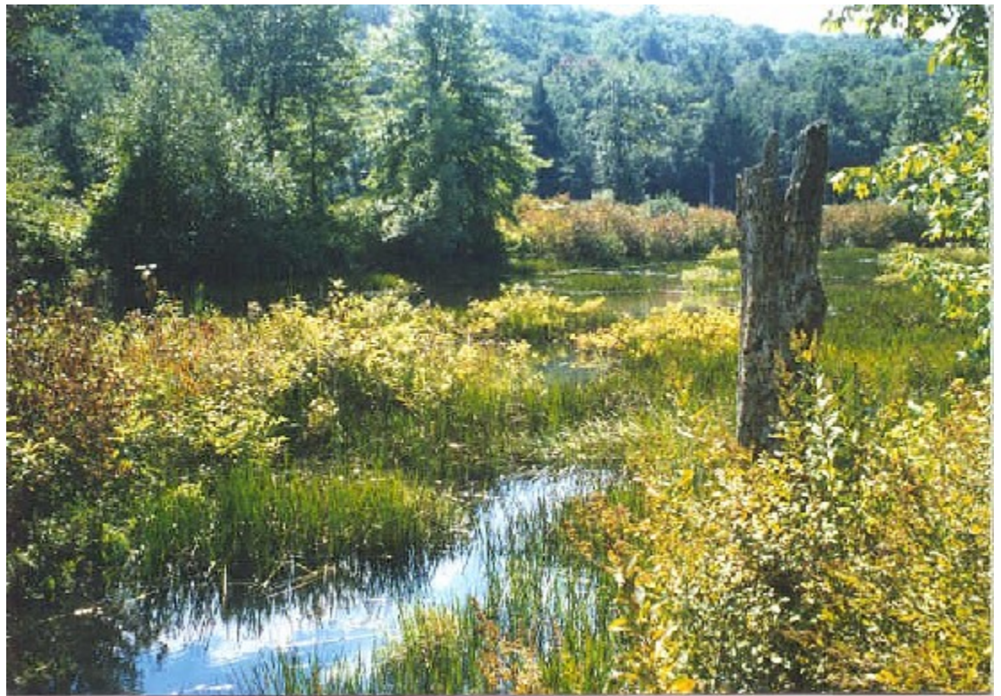
The “Little Virginia” wetlands along Stafford Meadow Brook