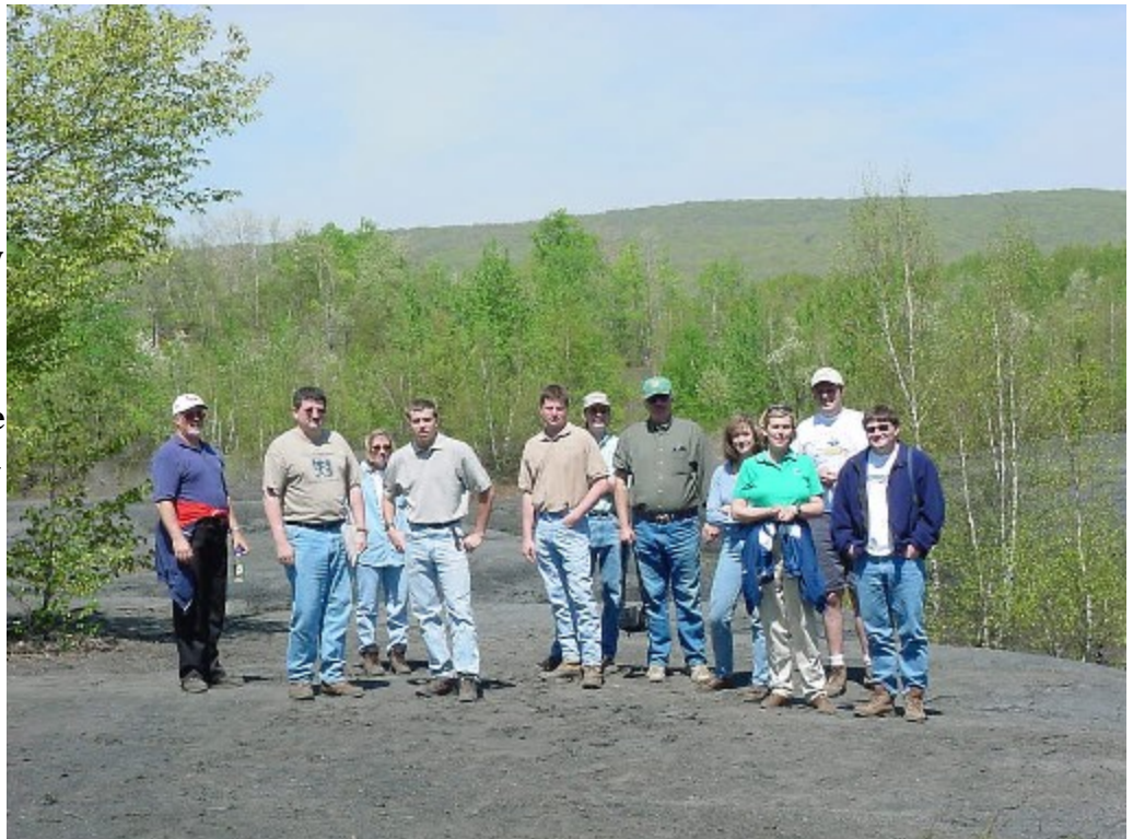
Staff from LRCA, US Army Corps of Engineers, PA Bureau of Abandoned Mine Reclamation and Lackawanna County Watershed 2000 Program, on reconnaissance at Powderly Creek, Carbondale Twp., May, 2001