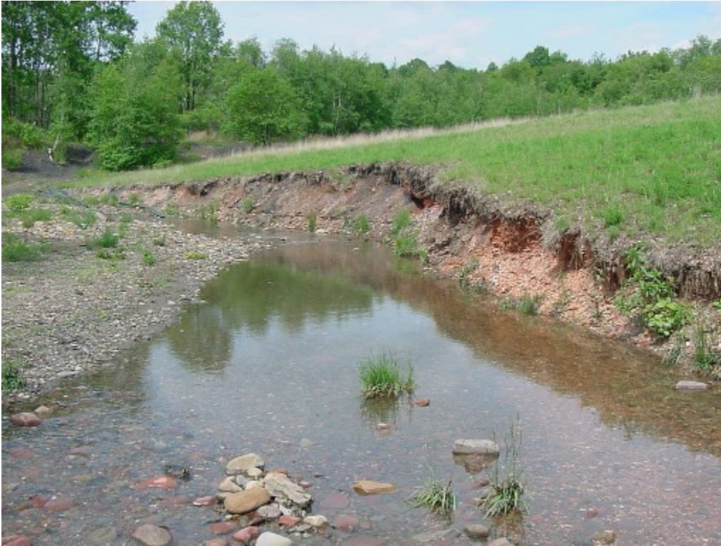
Keyser Creek bank cut at Moffat Colliery culm dump site, causing heavy erosion of sediment and red ash (burned culm residue) into Keyser Creek and the Lackawanna River