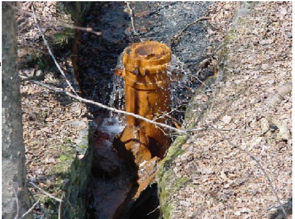
Standpipe discharge along the Lackawanna River near Vandling, PA. Its flow is less than 1 million gallons a day. This pipe was formerly a source of water for steam locomotives along the Delaware & Hudson Railroad.