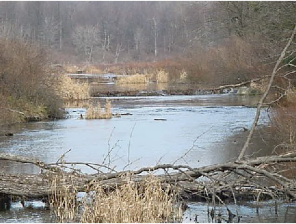
Mountain Mud Pond along the East Branch of the Lackawanna River