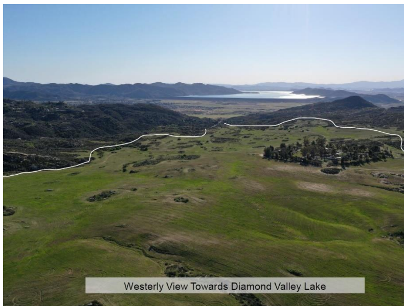
Westerly View Towards Diamond Valley Lake