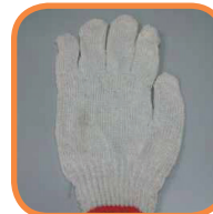
Cotton & Nylon Glove