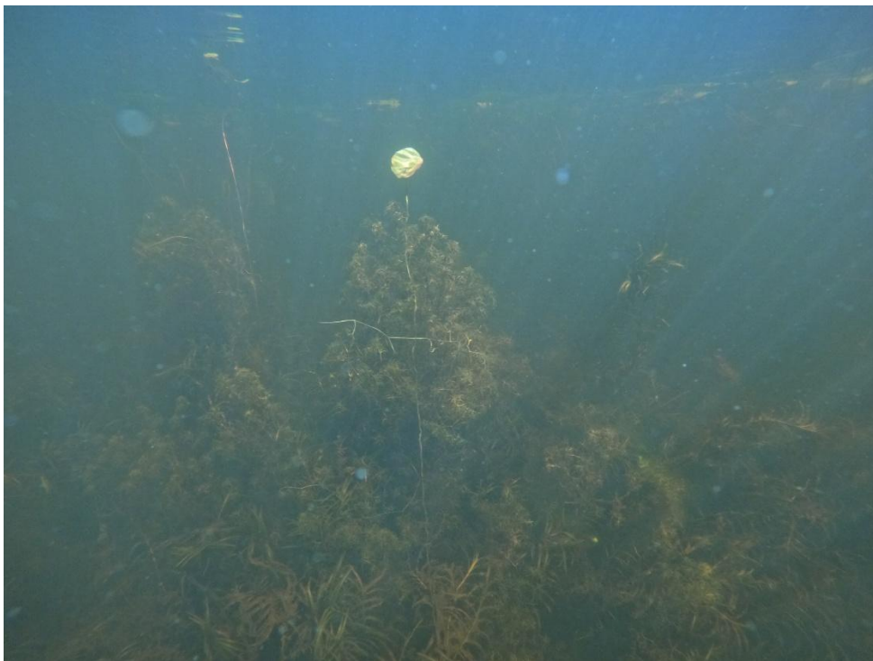
Top & Bottom: Large, bushy brittle naiad from along the lily pads between the Golden Acres Campground and the Sunshine Drive boat launch and beach.