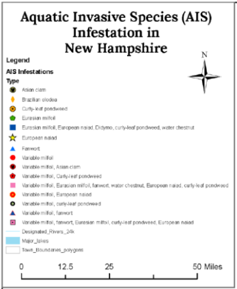
Map prepared by NH DES Exotic Species Program Updated Fall 2023

Numbers correspond to separate key which lists waterbody name and town.