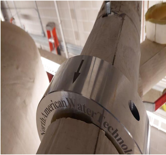
NAWT Collar installation on Cold water supply SDHWH