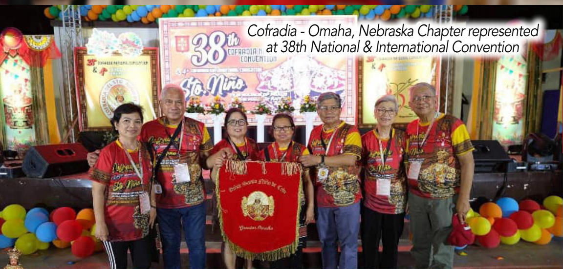
Cofradia - Omaha, Nebraska Chapter represented at 38th National & International Convention

✧ To sanctify its devotees, members, and their families through the recitation of the novena to Señor Santo Niño, active practice of their faith, frequent participation in the Holy Eucharist, confession, charitable works and social apostolate, and receiving of Holy Communion