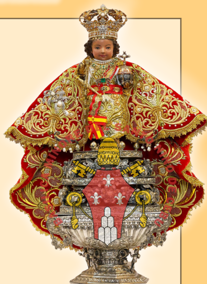
Original image of the Santo Niño de Cebu in His Fiesta Señor 2024 vestment and regalia