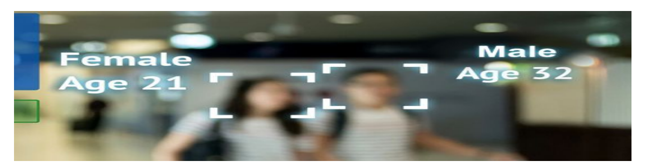
Tencent Partner Selects Invigor...