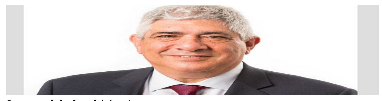
Sports and the law driving Aust...