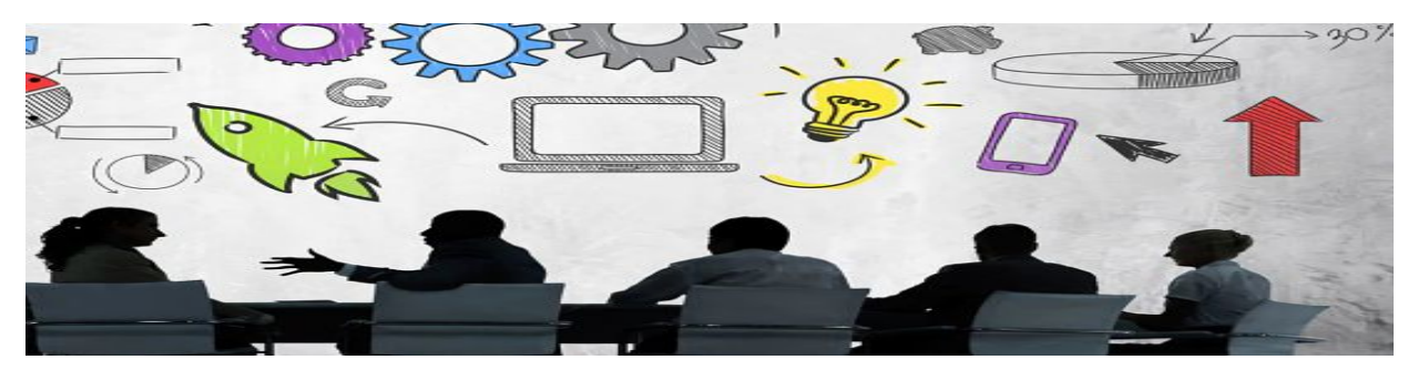
Five financial services trends ...