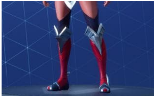
are being used to harvest children's personal data

Cyber-safety expert Ross Bark said crooks could use a child's username and password for a gaming site like Fortnite to extract more information including phone numbers, credit card details, dates of birth and home addresses.