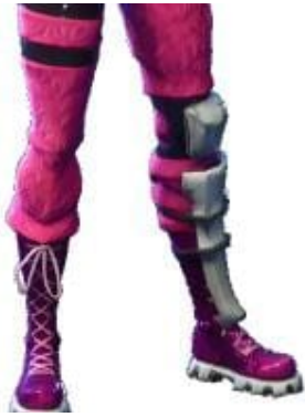
Popular video games such as Fortnite and Minecraft