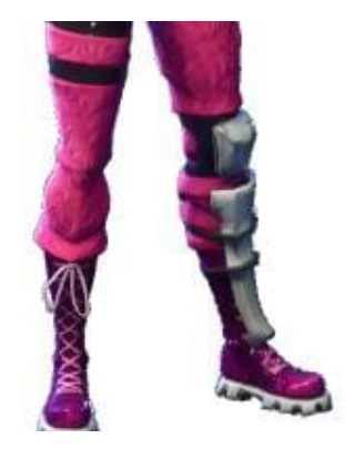
Depular video games such as Fortnite and Minecraft