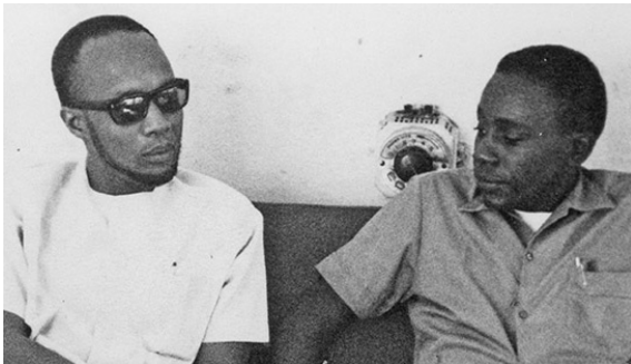
Amílcar Cabral (left), Víctor Dreke (right). Dreke led the Cuban volunteer fighters and doctors in Guinea-Bissau in 1967-68 during the independence struggle against Portuguese colonial rule.

Book available in English, Spanish, French.