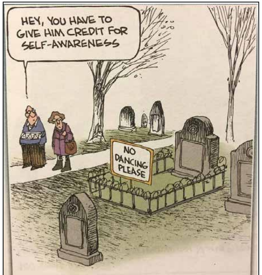
BERNIE MADOFF'S GRAVE

Send a check to P.O. Box 268, Hyde Park, NY 12538 or pay securely via PayPal at thehudsonvalleynews.com