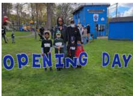
LOCAL LITTLE LEAGUE UNDERWAY...FOOTBALL CONCLUDES PAGE 3