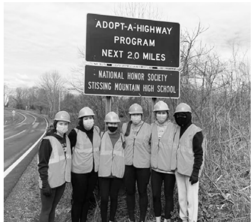
Stissing Mountain High School's National Honor Society roadside cleanup crew.

You have one weekend left to see the recorded live, streamed online production of "Pippin." Shows are this Friday, April 23 and Saturday, April 24, both at 8 p.m., and Sunday, April 25 at 6