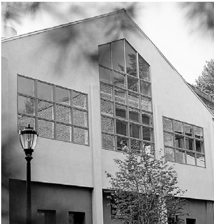
The Jeh Vincent Johnson ALANA Cultural Center.

In 1967, President Lyndon Johnson appointed him to serve on the National Commission on Urban Problems. He chaired the National Committee on Housing for the American Institute of Architects (AIA) and was awarded a special citation from the AIA's New York chapter for his advocacy of equal opportunity in the field, his pioneering work on housing issues, and his commitment to maintaining the cultural integrity and social responsibility of the profession of architecture.