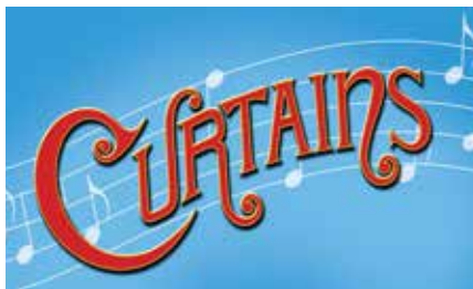
FDR HIGH SCHOOL TO PERFORM MUSICAL 'CURTAINS' PAGE 14