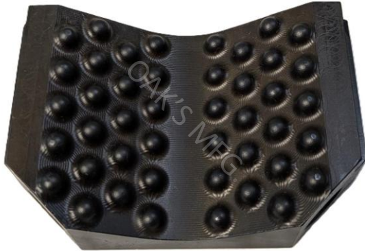
Aftermarket Full Length Break Out Table Jaw, replaces Epiroc P/N 3222 3285 51 and spacer OEM P/N 3222 3113 62