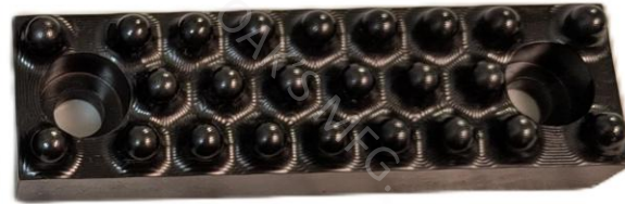
Aftermarket Break Out Jaw, replaces Furukawa P/N E083402050240