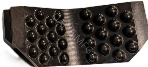
Aftermarket Break Out Table Jaw, replaces Epiroc P/N 3222 3285 51