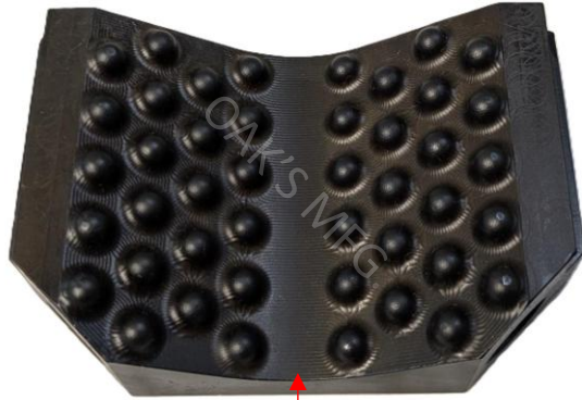
Aftermarket Full Length Break Out Table Jaw, replaces Epiroc P/N 3222 3285 51 and spacer OEM P/N 3222 3113 62