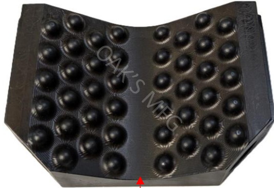
Aftermarket Full Length Break Out Table Jaw, replaces Epiroc P/N 3222 3285 51 and spacer OEM P/N 3222 3113 62