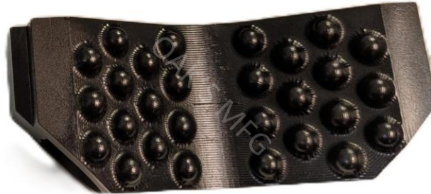
Aftermarket Break Out Table Jaw, replaces Epiroc P/N 3222 3285 51