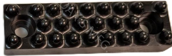
Aftermarket Market Break Out Jaw, replaces Furukawa P/N E083402050240