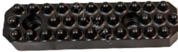
Aftermarket Market Friction Disk Jaw Plate, replaces Sandvik P/N BG00338144

Cross-Sectional View Full 360° Supported Contact Ball — Solid one-piece construction with no welds that could chip, crack, or fail.