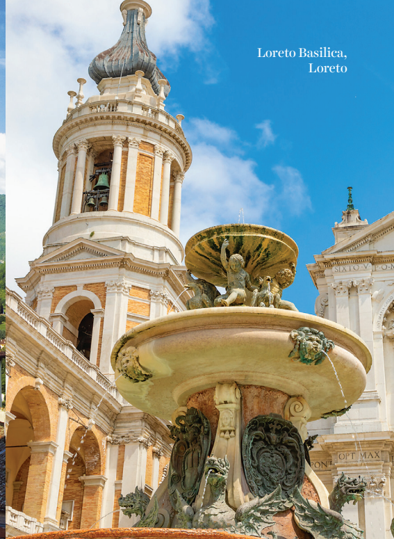
Loreto Basilica, Loreto