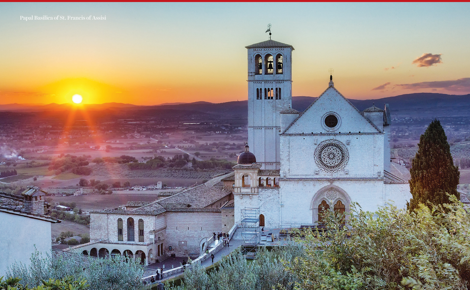
Papal Basilica of St. Francis of Assisi