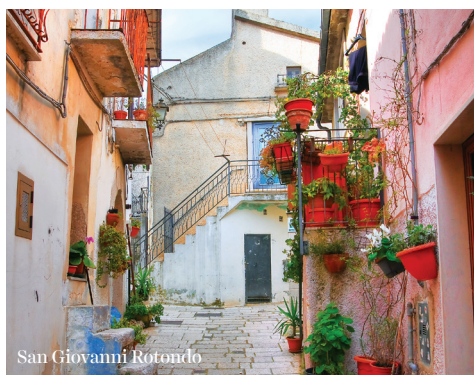
San Giovanni Rotondo

Michael the Archangel appeared in 490, 492, and 1656. Tonight, attend the candlelight procession in San Giovanni Rotondo. (B, D)