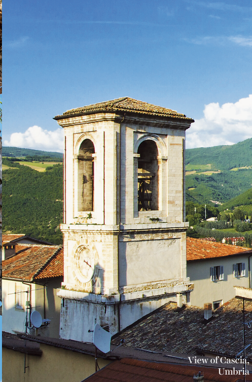
View of Cascia, Umbria