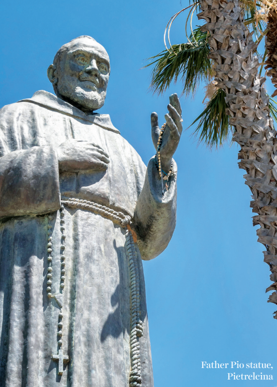
Father Pio statue, Pietrelcina