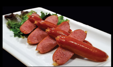
JAPANESE SAUSAGE 6.5