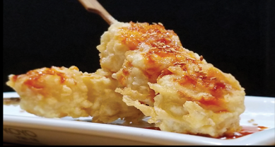
TEMPURA SHUMAI 6.5 with spicy bean sauce