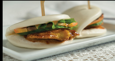
CHICKEN BUN 6.5 soft or crispy with spicy mayo

Japanese curry platter served with rice and salad with ginger dressing