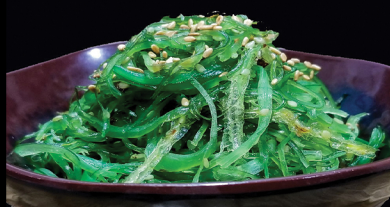
SEAWEED SALAD 4