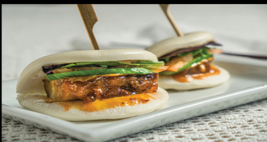
PORK BUN 6.5 soft or crispy with spicy mayo