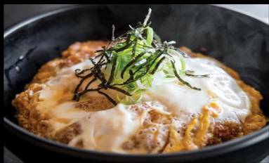
KATSUDON PORK or CHICKEN

consuming raw or undercooked meat, poultry, seafood, shellfish or egg may increase your risk of food borne illness