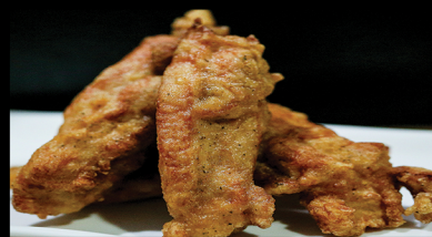
KARAAGE CHICKEN 5.5 marinated with fresh ginger juice