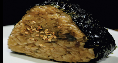
CHARSHU ONIGIRI 3.25