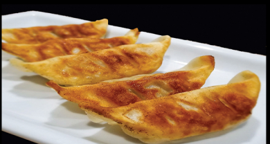
PORK GYOZA 5.5 pan fried or steamed