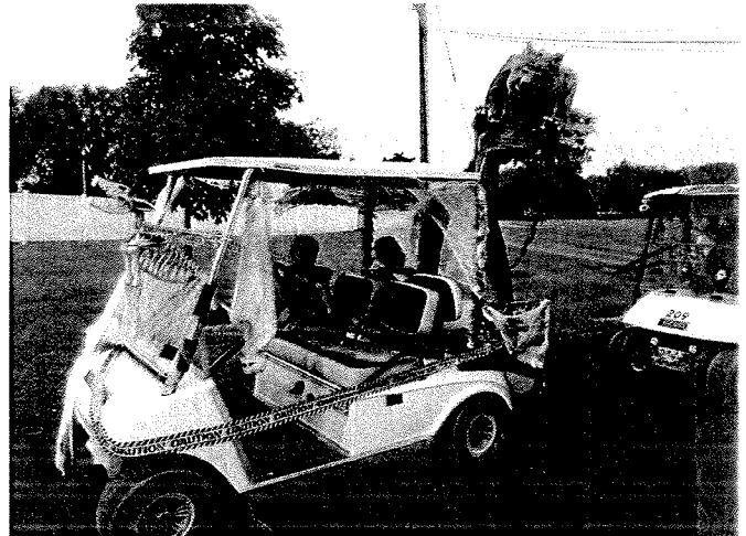
2 nd Lot 140 Taylor family