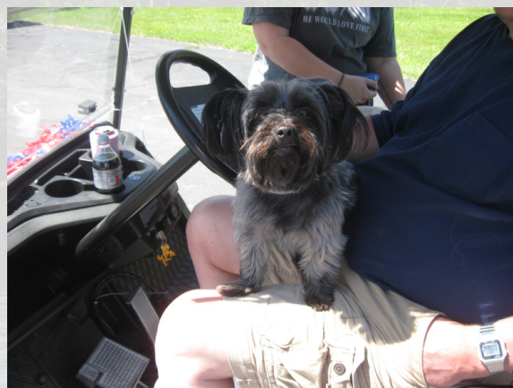
Check out this great dog!