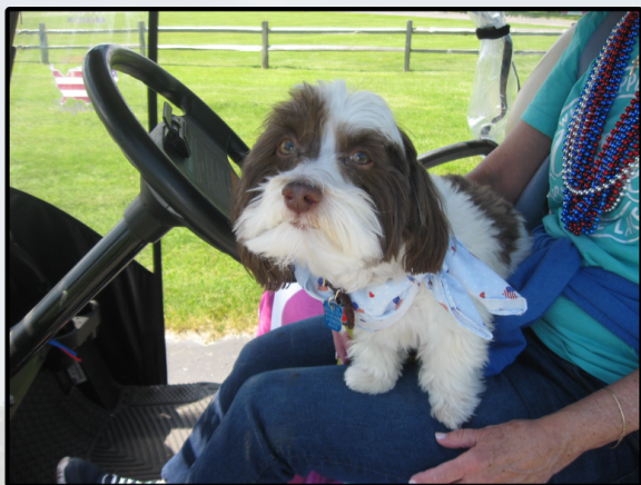
Look at this great dog!