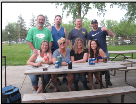
New residents this year!