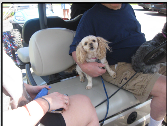
Feast your eyes upon this great dog!