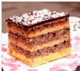
POPPY SEED LAYER CAKE