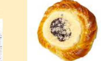
CHEESE & BLUEBERRY DANISH