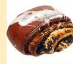
POPPY SEED DANISH