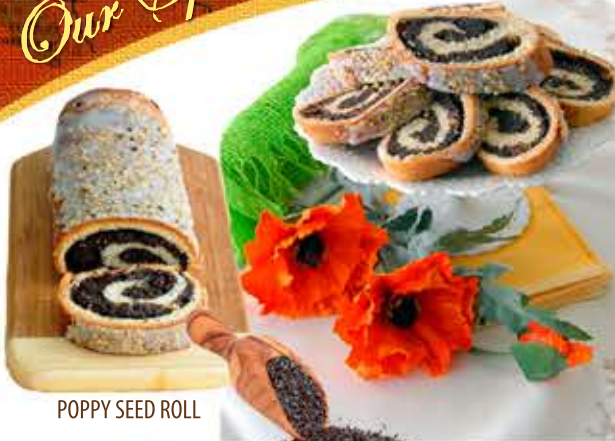
POPPY SEED ROLL