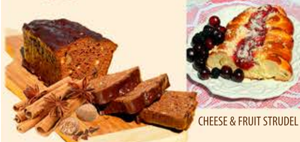
CHOCOLATE & HONEY LOAF