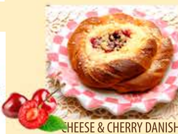
CHEESE & CHERRY DANISH