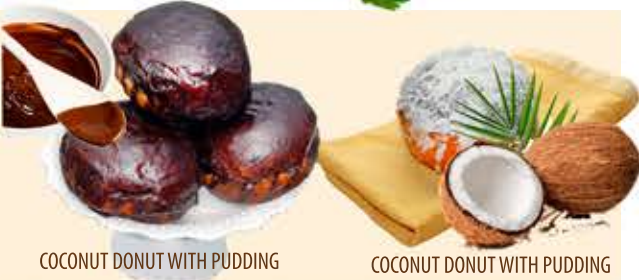
COCONUT DONUT WITH PUDDING