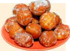
MINI GLAZED DONUTS