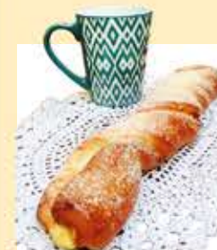
CHEESE DANISH STICK