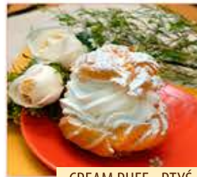
CREAM PUFF - PŁYŚ