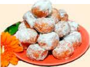
MINI DONUTS WITH JELLY