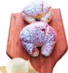
MINI CRESCENT WITH CHEESE