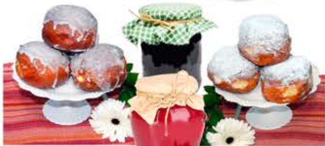
GLAZED JELLY DONUT