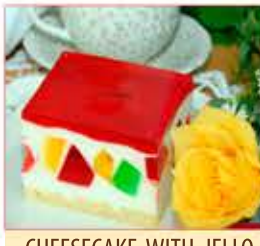
CHEESECAKE WITH JELLO