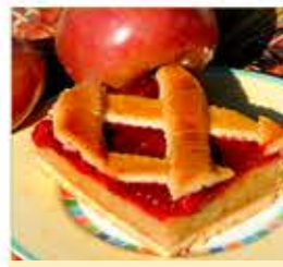
APPLE CHERRY CAKE