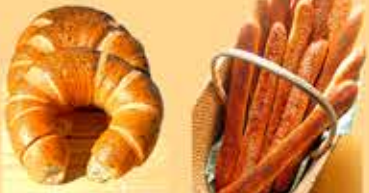
LARGE BAKER'S CRESCENT