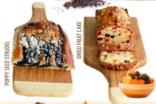
POPPY SEED STRUDEL