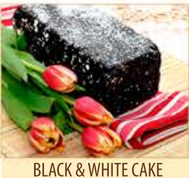
BLACK & WHITE CAKE