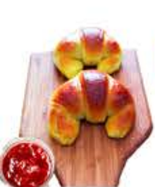
MINI CRESCENT WITH JELLY