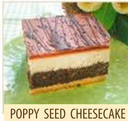
POPPY SEED CHEESECAKE