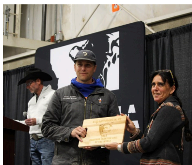
Doubet Cattle 2024 Champion Bull of the World CCD Kingsman 3K ET