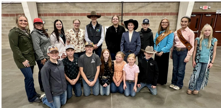
2026 MJHA Members