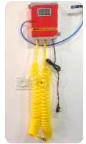
Wall mounted digital tire pressure gauge