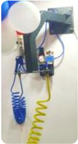
180 degree Swirl Type Pneumatic Hanger With brass connector