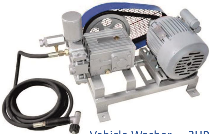
Vehicle Washer - 2HP