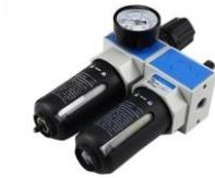
1/2 inch Filter Regulator with Lubricator used in pneumatic line to remove moisture from line