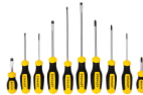
Screw Driver Set