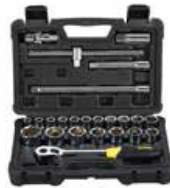
1/2 inch Socket Set