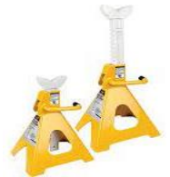
Tripod Stand 2 Ton