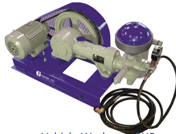
Vehicle Washer - 3HP