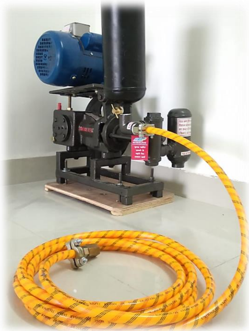
Vehicle Washer – 1HP