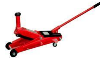
Floor Jack 2 Ton