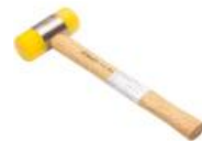
Soft Face Hammer