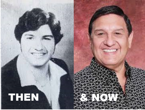
SQUARES BY JOE SALTEL