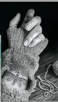
Red Balloon & (W)hole Fresh Start Visual Art Guild of Frisco