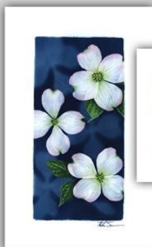
Carolina Puddles & Bloom Power of the Flower Exhibition Visual Art League of Lewisville