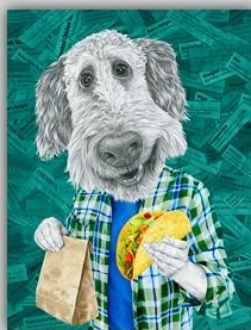
Taco? Grapevine Contemporary 2025 RTown Gallery