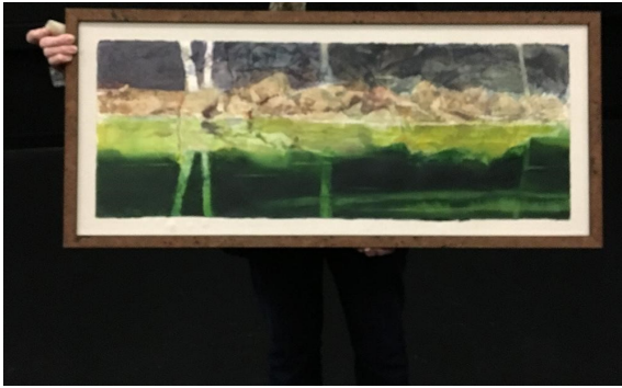
First Place Lorraine Hayes