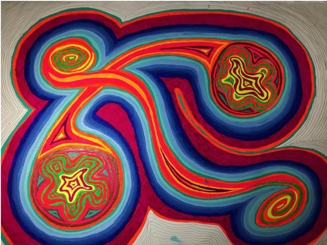
Work in progress by Jim Connell; 23" x 30"; acrylic on Arches paper

With so many art shows and galleries being closed for now (including the MCL Grand), VAL wants to provide ways to stay connected and offer inspiration for our "sheltered in place" artists! Much of the art is currently featured on the VAL homepage .