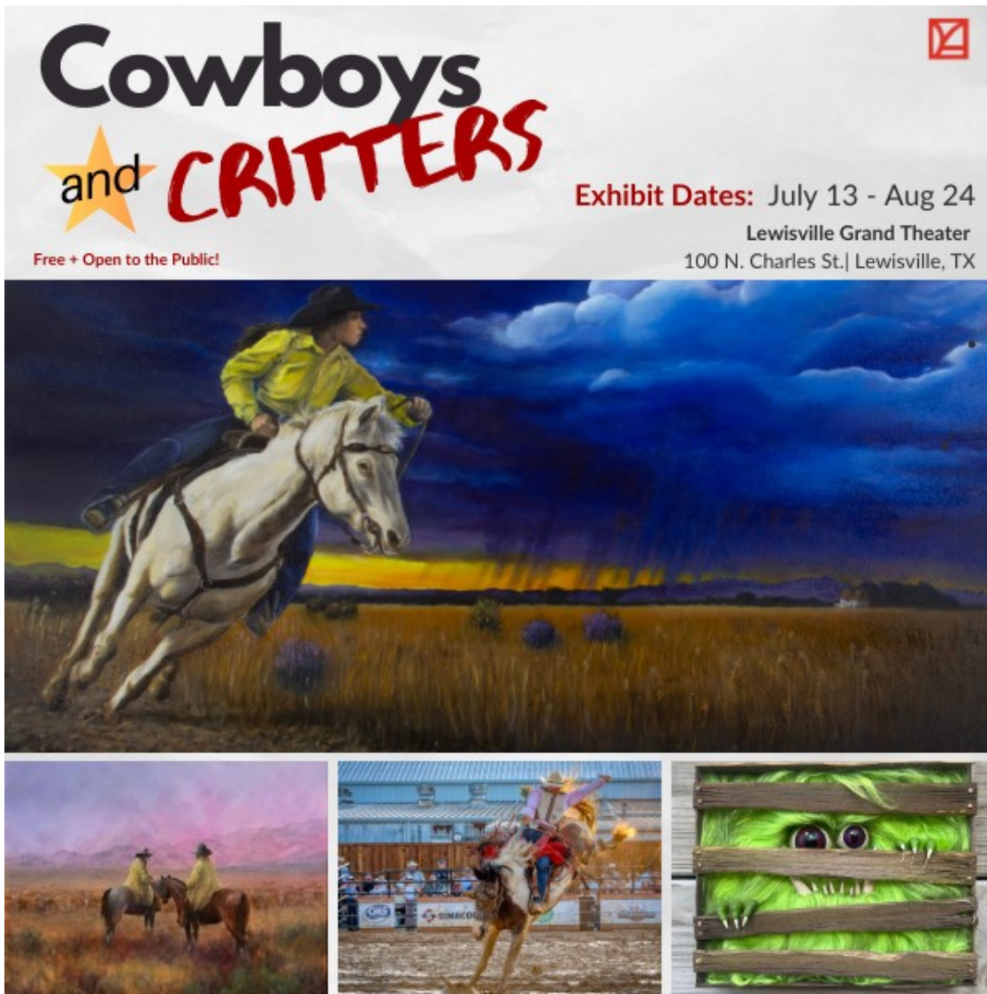
Exhibit: Cowboys and Critters Dates: July 13–Aug. 24