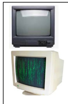
Cathode Ray Tube TV and Monitor