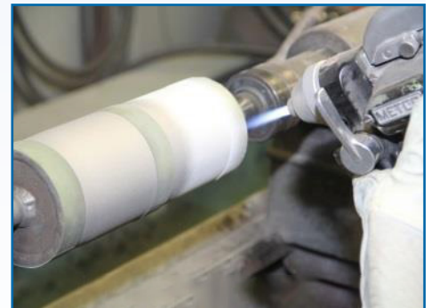
170-10s Green Masking Tape