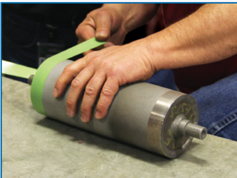
170-10S Green Masking Tape