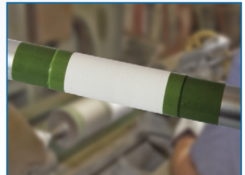
170-10S Green Masking Tape with SW-35 Silicone Coated Fiberglass Fabric (white)