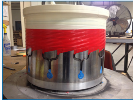
170-10S Red and HVMT Orange – High Velocity Masking Compound (blue)