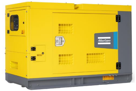
Genset Image for illustration purposes only