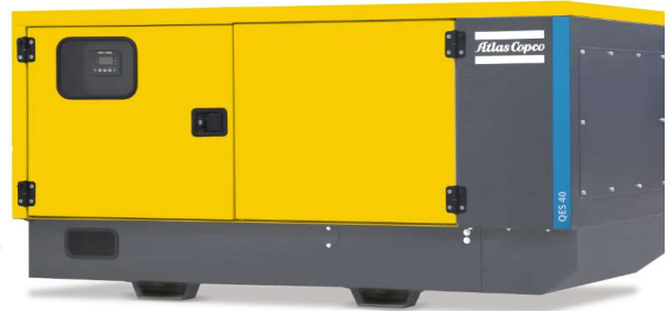
Genset Image for illustration purposes only