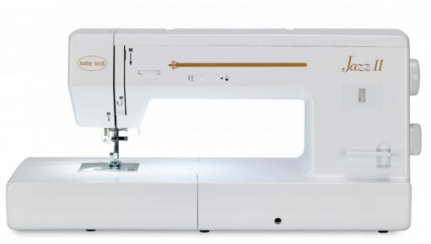
Baby Lock Jazz II