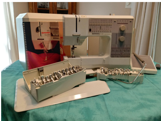
Bernina 1230 $800.00

The wood needs cleaning but it does store away. Has been serviced, runs perfectly has a knee lever as the pedal and a working light.