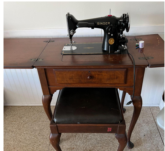
Antique Singer Queen Anne's Featherweight - 1940 Model 201