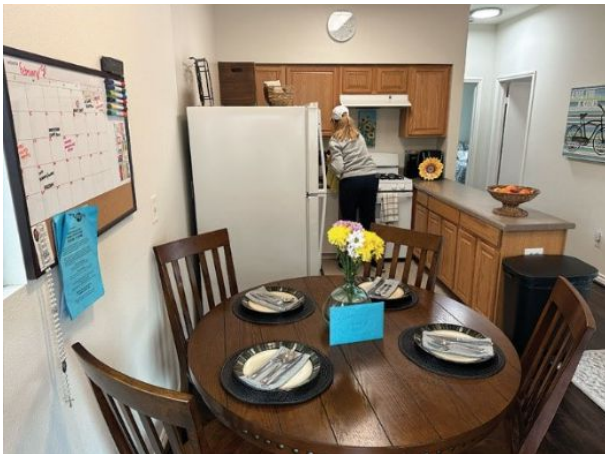
Rooms furnished with donated items from House 2 Home, a division of Deed and Truth.

If you have any next-to-new furniture, please reach out! Monetary donations also appreciated: www.deedandtruth.org . Item donations please contact Lynne @ 949-697-4549.