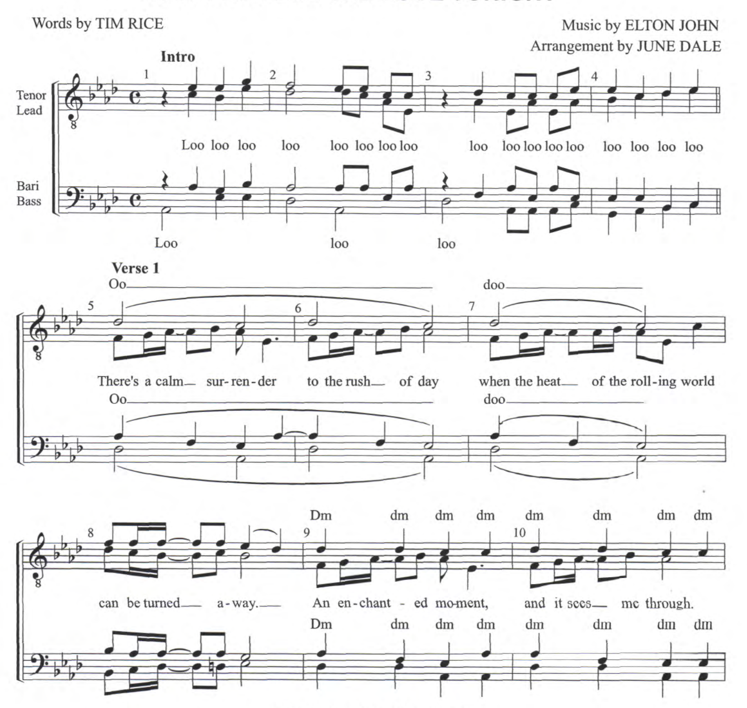
© 1994 Wonderland Music Company, Inc. This Arrangement © 2005 Wonderland Music Company, Inc. All Rights Reserved. Used by Permission.