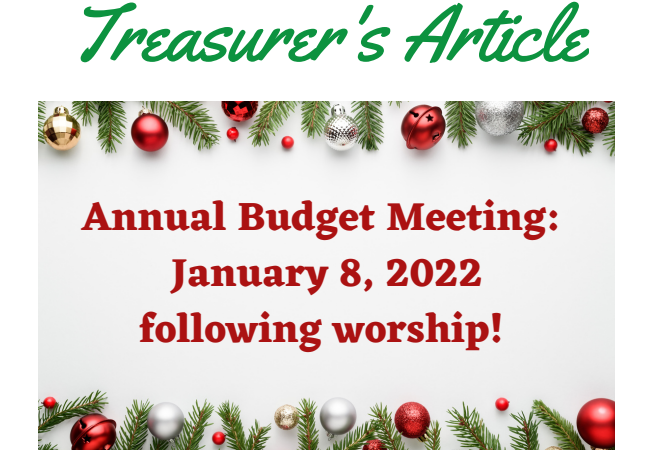
The Budget Process-

The Budget Committee is in the process of developing the Church budget for next year. This is an involved process with the steps defined in the Church By laws.