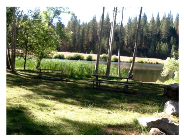
Worship at White Pines August 20th, 10am