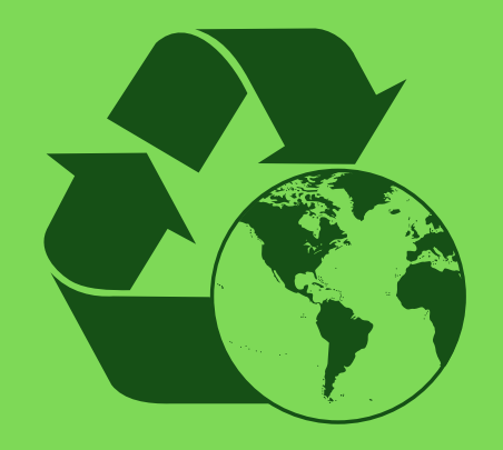
Recycling is picked up at the church on the first Wednesday of every other month at 9am sharp. The next recycling pick up will be on July 5.