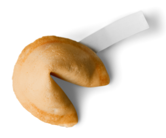
Have a Cookie!

PLEASE JOIN US AS WE GATHER ON THE FIRST WEDNESDAY OF THE MONTH AT NOON IN PRAYERS FOR PEACE AND THE RINGING OF THE CHURCH BELL.