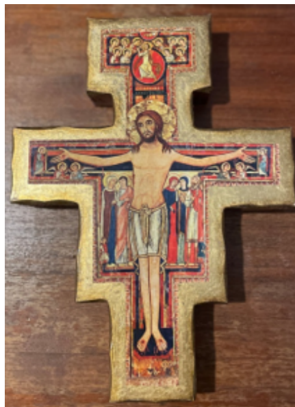
The cross at San Damiano