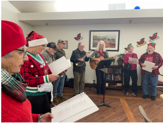
A few of our wonderful musicians spreading the Christmas Cheer!