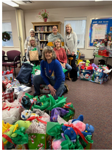
The Outreach & Social Justice team is busy wrapping gifts for all the folks at Golden!