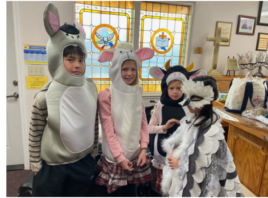
The Animal Stars at the Christmas Performance were adorable!