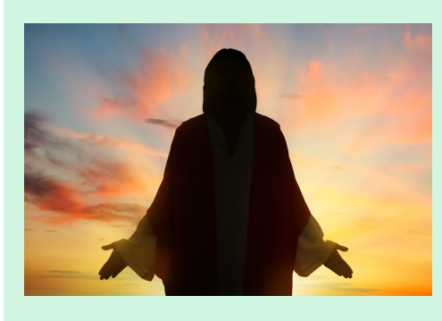
Small Group Meetings:

Jan. 9: South Grove Bunch 5:30pm in Eastman Contact Faye Morrison