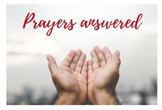
The scriptures tell us:

Don't see your birthday listed? We promise it isn't on purpose. Please contact the church office to have your special day added to our list.