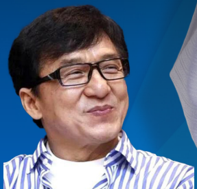
Jackie Chan Commences Shoot For His Martial-arts Comedy 'Ride On'