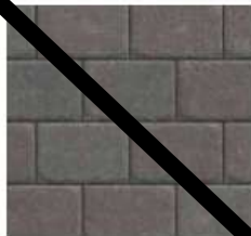
CHARCOAL Only available in 6 x 9