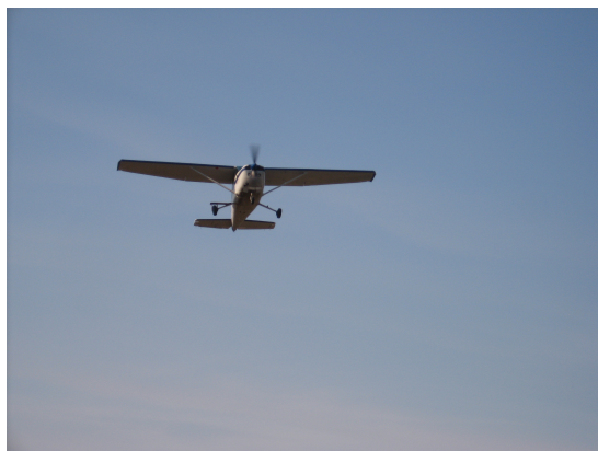
A jump plane taking off from Lufker Property

Get ready for a noisy summer – the jump planes may be coming back. We have just received a copy of the “stipulation of settlement”, which resulted from the the Town settling its lawsuit against Lufker “airport”. The lawsuit had temporarily stopped the illegal and unrestricted operation of noisy jump planes over our homes. The “settlement” may make things worse for us, allowing the unrestricted operation of any aircraft, including jump planes and helicopters from the Lufkers property. The stipulation also undermines the zoning code by formally designating the residentially zoned property as an “ airport ”. This is a de facto change in zone and was done without any public review or input as normally required under Town law.