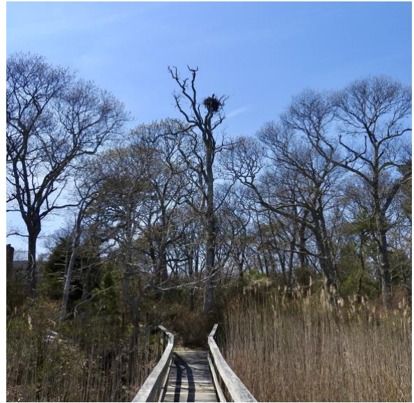
Photo of the new osprey nest in the park